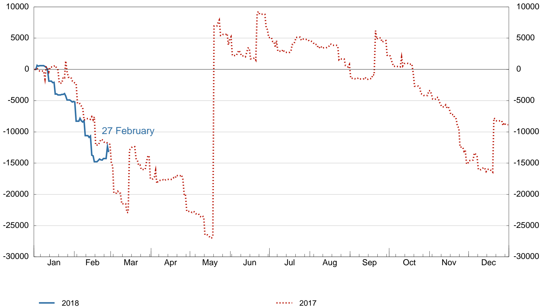
Figure 2. Net liquidity from government bonds and Treasury bills accumulated from 1 January, million NOK